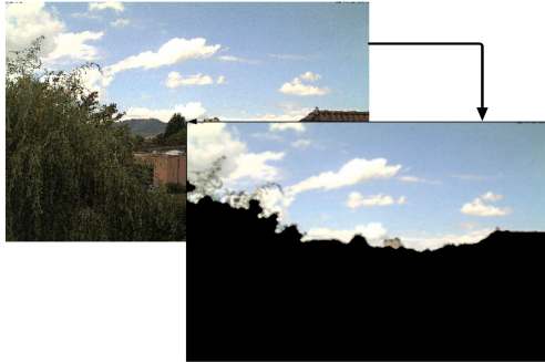
Fig. 1: Horizon detection (image segmentation) using yellow and black channels after converting an image to the CMYK color space