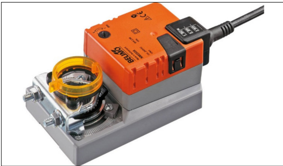
Drive of the company BELIMO Automation AG. BELIMO Automation AG, Technisches Datenblatt LM24A, 2019.

Initial Situation: The company BELIMO Automation AG, based in Hinwil, develops, produces and sells electric actuator solutions in the heating, ventilation and air conditioning technology. BLDC motors, which are manufactured by an external partner, are used in their damper drives. The agreed tolerance limits for speed and current consumption are relatively generous. The aim of this work is to find conspicuous features and influencing factors in the production data in order to optimise the production of BLDC motors.