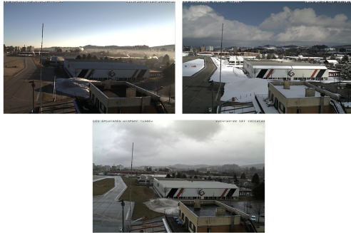
Example images of the three weather conditions: sunny, cloudy and overcast.