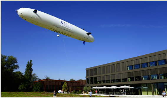
Testride of HSaiR

Introduction: The HSaiR (Helvetic Solar Airship) is an airship developed by HSR (Hochschule für Technik Rapperswil). The long term goal of this project is to realize an autonomous, solar-powered airship that can stay in the air for as long as possible with optimal efficiency and optimized manoeuvrability. Therefore more knowledge and experience must be gained about the flight dynamics of the airship. The purpose of this semester thesis is to understand the dynamics, carry out further test rides and evaluate and optimize the manoeuvrability of the system by changing the yaw propeller concept.