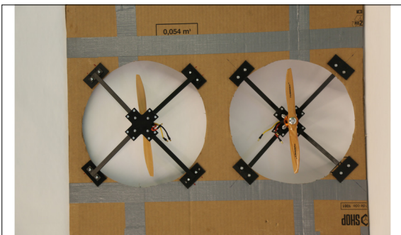
New yaw propeller concept

In order to further reduce the moment of inertia and mass, lighter components are recommended. The fin in which the yaw propellers are mounted should be made from composite materials. This measure could reduce the total mass by 0.5 kg. For realizing an autonomous system, a flight recording system is needed providing all the necessary information such as current position, altitude and speed above ground. The PixHawk V2 Autopilot is a system that can offer all this data at an excellent price.