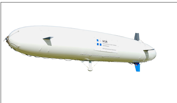
Components of HSaiR version 1