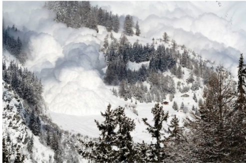
Powder Avalanche

If a person gets caught by an avalanche the time of rescue is crucial in order to save the victim from a painful death. Even though rescue technology progressed in the last couple of years and provides several solutions in order to fasten the location and rescuing process, there are still too many fatal accidents happening until this day. The main objective of this project is to determine whether it is possible to track an avalanche victim during the avalanche outflow by using a GPS receiver hardware combined with an inertial measurement unit. Moreover, to determine the possibility to extrapolate the victim's position based on the given inertial navigation data even if the GPS reception is lost during the avalanche incident. In a first step the basics of snow, avalanche dynamics, rescuing and avalanche victim's statistics have been examined in order to provide an established knowledge base for the upcoming workflow in which the evaluation and design of a suitable logging hardware was pursued.