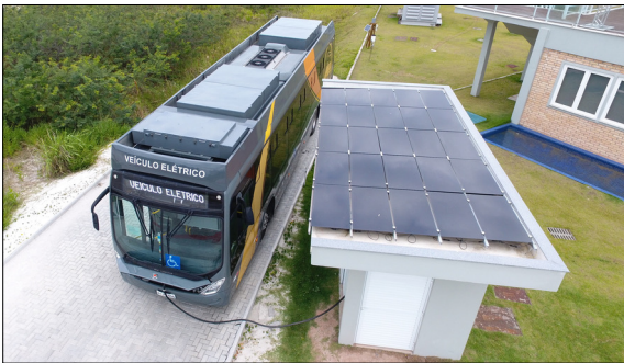
e-Bus at the 75kW charging Station of Sapiens Parque with its four battery packs with a total capacity of 128kWh