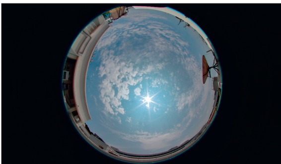
HDRI image. Image merged from three images at different exposure time

A new WSI was developed: the wide angle high resolution sky imaging system (WAHRIS) 3. With common materials, such as plastic, and readily available hardware, such as a spherical test tube as a dome, it was possible to construct an inexpensive (less than 200 SGD without camera and lens), compact (320x300x140 mm) and rainproof housing. High-resolution images will be taken by a Canon EOS 600D with a fisheye lens. For image processing and temperature control, the SBC from ODROID-U3 with a 1,7 GHz Quad-Core processor and 2 GByte RAM is used.