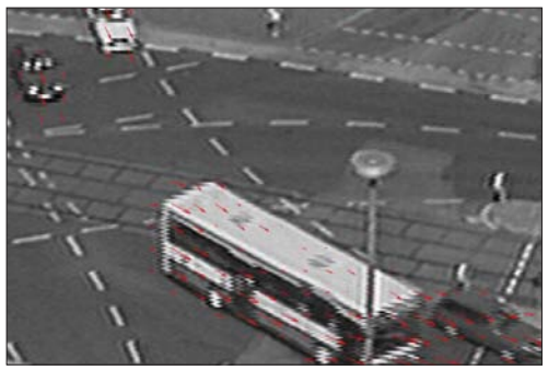
Optical flow field of a traffic sequence

Fast and Accurate Lucas-Kanade Extended Optical Flow Algorithm using CUDA GPU Computing 9