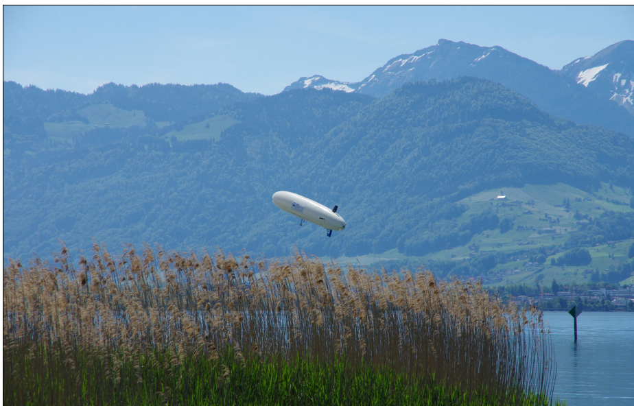
The airship over Lake Zurich Self-made picture

Introduction: The development in recent years has shown several different use-cases for zeppelins and other lighter-than-air airships. HSR has developed its own airship, which has to operate energy self-sufficient and autonomously. The airship's board controller is a wePilot4000 of weControl SA, which contains a GPS module, a magnetometer, a 9 axis accelerometer and a barometer and is able to drive all actuators. The wePilot is programmed in Oberon, a programming language developed at the ETH.