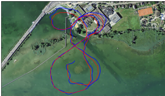
Planned (red) compared to flown (blue) course Self-made illustration