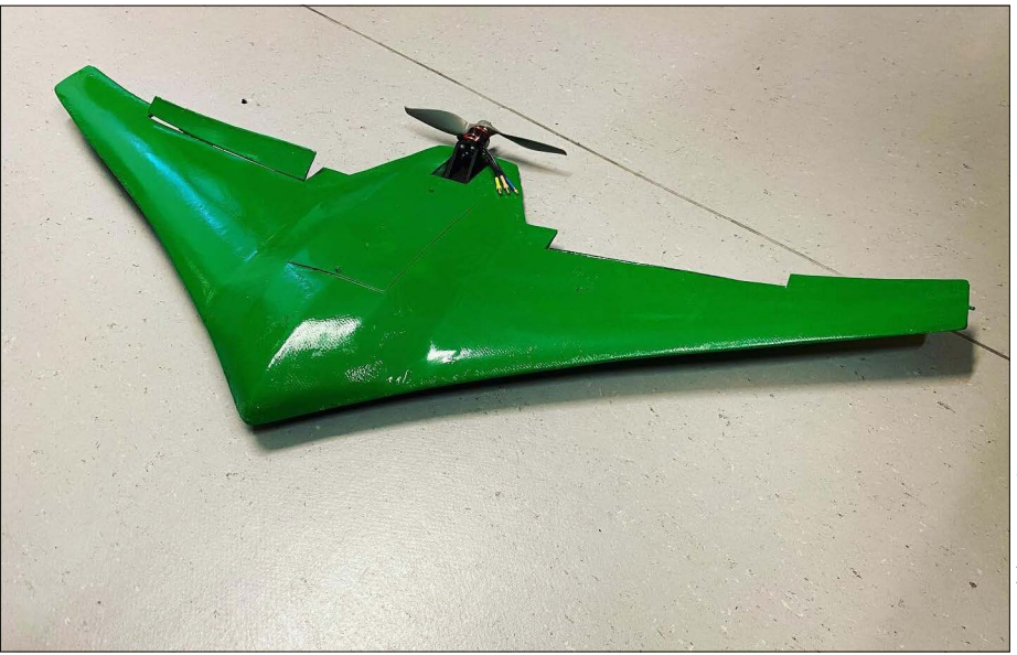
Fig. 1 One-metre version of the Green Raven for first flight test (kthaero.com/greenraven)

One of the challenges in the operation of hydrogen fuel cells is the storage of the extremely volatile but energy-rich and light gas hydrogen. There are basically two ways to do this: One is to cool and liquify the gas at -253 °C, the other to put it under high pressure to increase its density and make it transportable. For large systems that consume the hydrogen quickly, such as rockets, the cooled route is chosen. For small systems that need to store