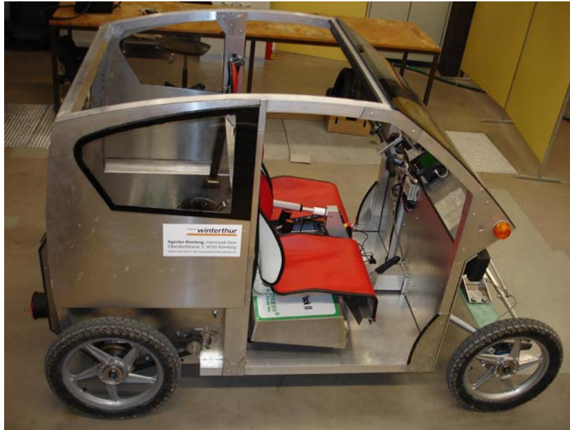
Figure 5: The pre-prototype, without front-end, doors or inside finish

The driving tests gave the following results: