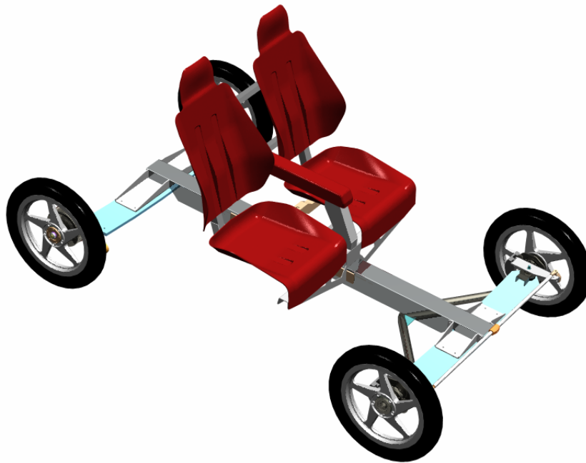
Figure 6: Reworked chassis with leaf springs and special tyres

Road tests confirmed that the reworked suspension in combination with the special tyres significantly improved the comfort of the ride.