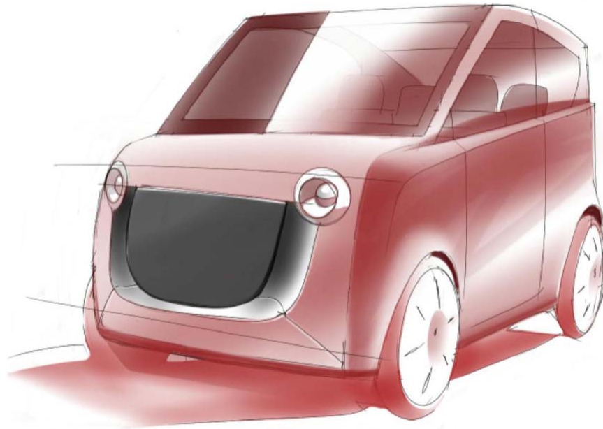
Figure 7: The new exterior design

In 2007 two complete prototypes will be built to the reworked design, with the goal of securing the official Swiss type approval for the vehicle.