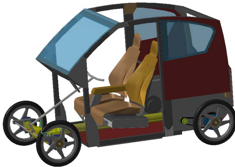
Figure 3: The tubular lattice frame with shear-resistant floor and windows

A light tubular space frame carries the superstructure surrounding the passenger compartment (Figure 3). It is securely fastened in the back at the rear to the fixed axle via the axle stubs and in the front in the middle of the transverse beam between the A-pillars. Cold joining methods are used exclusively for the joint of the space-frame, so as to avoid welding with its accompanying risk of thermal distortion and heat affected zones. The aluminium sections of the tubular frame are generally straight, or bent in two dimensions in the case of the roof frame. They are fastened together with corner plates, by riveting combined with adhesive joining. The sandwich floor and the polycarbonate windows form large shear-resistant elements that further stiffen the structure. The polycarbonate windshield is additionally coated with a scratch-resistant material.