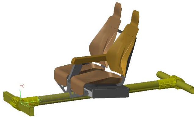
Figure 2: The longitudinal torsion beam with the rigid axles and the spring-mounted seats

A longitudinal torsion beam that is joined to the rigid axles by cast alloy nodes forms the chassis and part of the suspension (Figure 2). All these components are made of aluminium alloy. The longitudinal beam is designed with some flexibility, so that it can adjust to unevenness in the road by elastic torsional deflection. Its required torsional stiffness was calculated by numerical simulation of the dynamic behaviour of the chassis under service conditions.