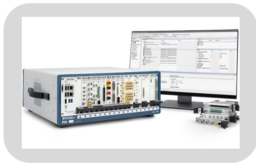
Figure 2: PXI Test Equipment, Reference: NI, accessed 7.3.2023 < https://www.ni.com/de-ch/shop/pxi.html >.

Design for Test: The sensor is controlled by additional electronic circuits. The overall system and its subcomponents are designed and prepared for testability. In the process, students will be familiarized with test coverage, logic and fault simulation, Built-in self-test, scan test, analog test methods, etc. Design and simulation will be done with state-of-the-art CAD tools with respect to Application Specific Integrated Circuit (ASIC) Implementation. We synthesize a digital part described in VHDL, which we place and route (P&R). After each development step, we simulate the digital circuit and create test patterns with an ATPG tool. However, since the fabrication of a complex ASIC is not possible in such a short time and with the available equipment, the digital part of the circuit is fabricated as Field Programmable Gate Array (FPGA) and the analog part in the form of discrete components.