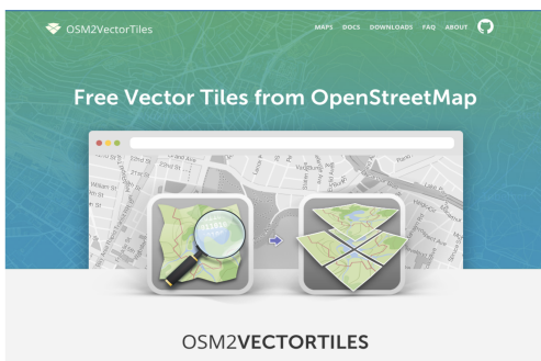
Screenshot of the project website of OSM2VectorTiles.org

Result: The results of this thesis are vector tiles of Switzerland. They are available for download from the project website ( http://osm2vectortiles.org ). These vector tiles can be served together with a custom or Mapbox visual style in our vector tile server. As the entire workflow of creating vector tiles is documented and open-source available, other organizations could now use this project to produce vector tiles of their own datasets.