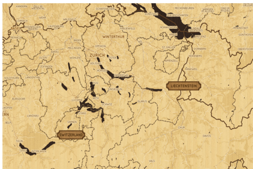
Mapbox' Artistic Woodcut visual style.

Approach/Technologies: The main objective of this project is to create free and open-source vector tiles of OpenStreetMap data, so that every developer, cartographer or designer can create their custom maps. An entire workflow for producing vector tiles was defined and a vector tile server to serve the produced vector tiles was implemented. The vector tiles are compatible with the vector tiles of the Mapbox Streets product. Therefore the same visual style provided by Mapbox can be used with our vector tiles. The figure below shows the Mapbox Artistic Woodcut map style, which can be used with our vector tiles as data source.