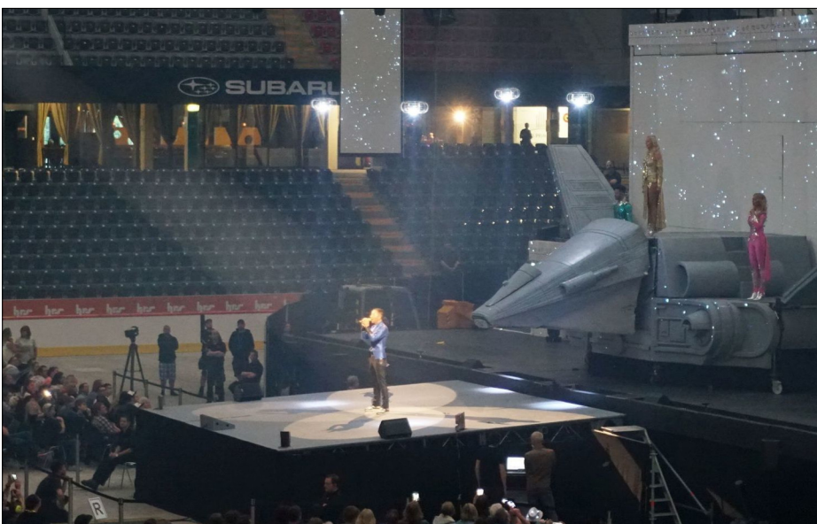
Snapshot of the main rehearsal of DJ Bobo's Kaleidoluna show with the drones. Hannes Diethelm

Result: The newly developed indoor localization system can determine up to 143 positions per second. The accuracy achieved is outstanding: 68% and 95% of the positions lie within a sphere with a radius of 3.5 cm and 6.3 cm, respectively. Every drone, independent of the number of drones in the system, receives its position 12.3 ms after the pulse transmission. This low and constant latency is highly advantageous for the subsequent flight controller. The operating range of the system exceeds 100 m. In summary, the proposed localization system makes indoor light shows with more than 30 drones possible, with an accuracy equivalent to the size of an apple.