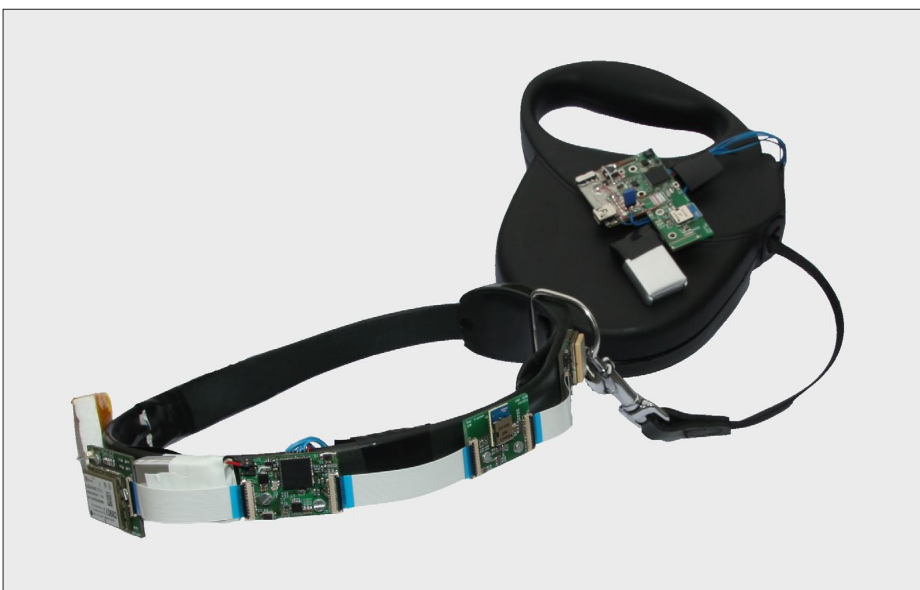
The functional prototype of the collar and the corresponding leash logic