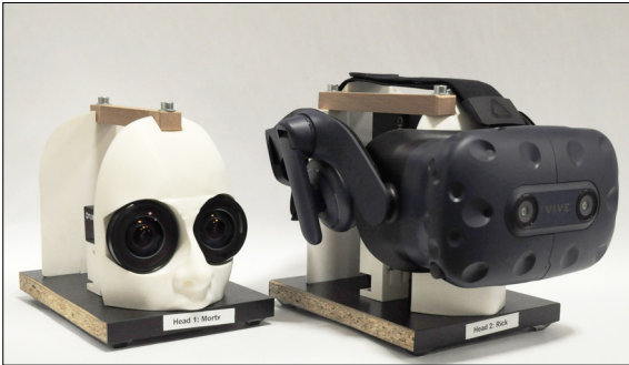
test-device Own presentment

Introduction: VRMotion GmbH and HSR engineers developed a Virtual Reality (VR) Motion-simulator. It is mainly used for flight-simulation.