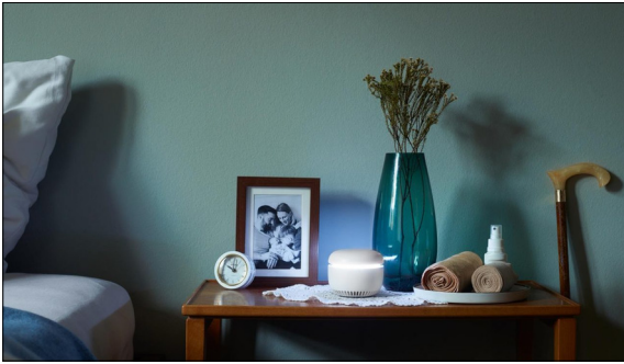
The CARU Smart Sensor placed in the home of a senior citizen CARU AG